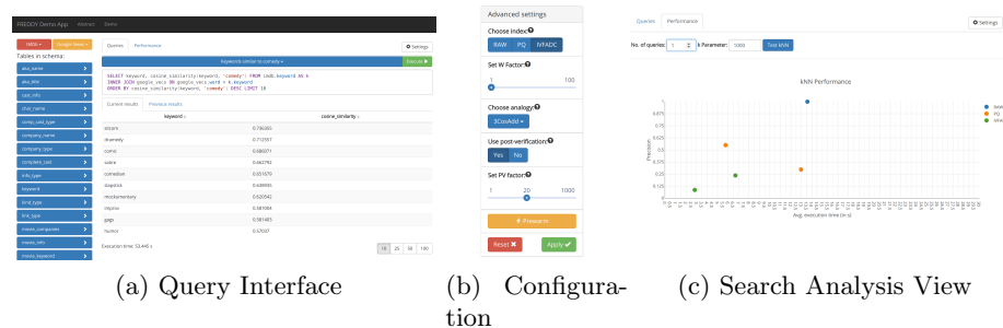
Fig. 3: Demo Interface

A web application makes it possible to explore these novel query capabilities on different database schemes and a variety of word embeddings generated on different text corpora. From a systems perspective, the user is able to examine the impact of multiple approximation techniques and their parameters for similarity search on query execution time and precision. The main views and the configuration element are shown in Figure 3.